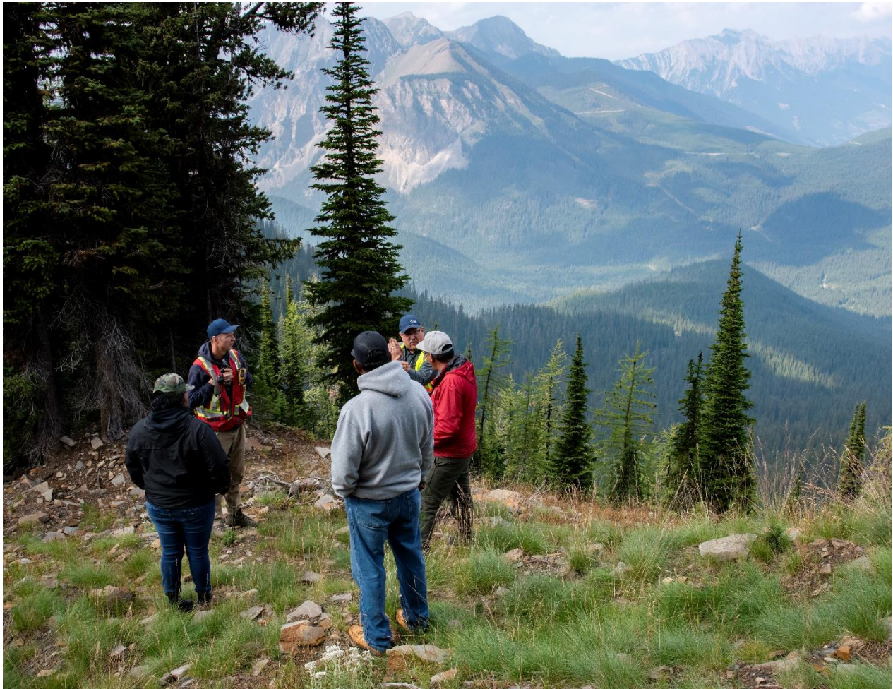
Discussing Project layout with representatives from the Piikani Nation during a September 2022 site visit

NWP also expects to have a busy summer of site visits by Indigenous nations, elected officials (municipal, regional, provincial, and federal), BC Environmental Assessment Office, the Canadian Impact Assessment Agency, and other regulators.